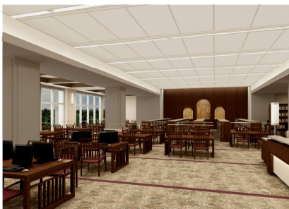
Outer Reading Room