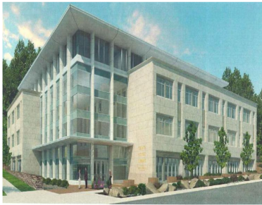
Church History Library