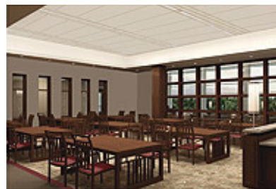
Inner Reading room