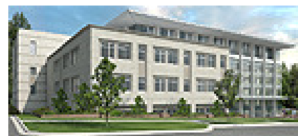
Artistic rendering of LDS Church History Library