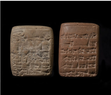
Cuneiforms are one of the earliest forms of writing