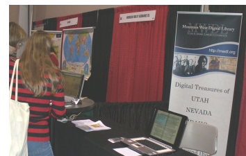
MWDL Booth at UEA Conference

More information on the Mountain West Digital Library can be found at http://mwdl.org .