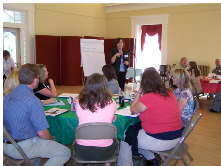
Summary of the Table Talk Discussion