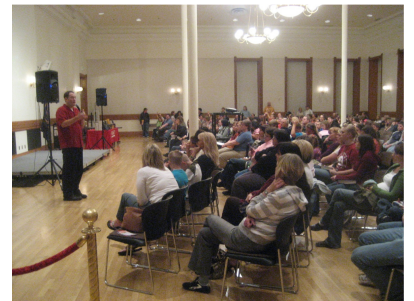
Brandon Mull speaking at Provo City Library

Mull gave a fantastic interactive presentation on reading genres and their appeals and the writing process. The audience was excited to see the new cover art for the final Fablehaven installment. Following his comments, he held a short question and answer portion. Finally, Brandon stuck around for two hours signing books and talking to his readers.