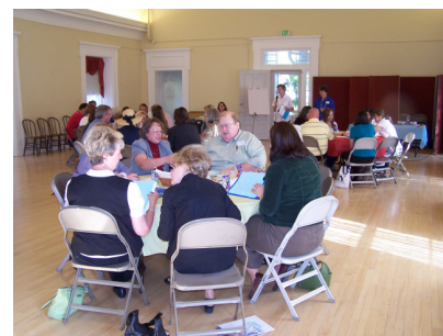
Opening Session at the Utah Territorial Statehouse