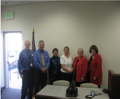
Trustee Conference Attendees

Utah State Library and Utah Library Association sponsored their first joint regional Trustee conference at Logan Public Library on November 5 th . Virtually all in attendance considered it an overwhelming success with nearly 90% requesting another conference in the coming year. Their other comments included: "great resources," "got us thinking," entertaining, fast paced, good handouts, "very informative for a new trustee like me," and "thanks for exposing me to technology innovations I did not know existed." There were 25 trustees and nine directors and staff who attended to learn about 21st Century Skills, new technology and their Utah Library Association. The North Central conference will be held November 18th at the State Library.