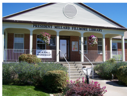
Breakout Sessions Were Held in the Fillmore Library and City Hall