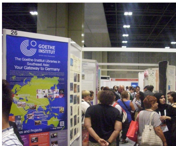
Poster session. Edited for publication by Annie Smith.