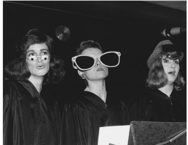
Law students in "First Year Follies," c. 1983