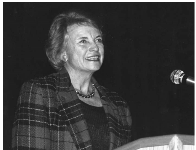
Sandra Day O'Connor addresses the College of Law, 1996

It is these and countless other memories that make the College of Law the excellent institution it is today. Please join us in celebrating this fascinating history by visiting the S.J. Quinney College of Law Centennial Photographs Collection. We also encourage you to share your own stories with us at http://history.law.utah.edu .