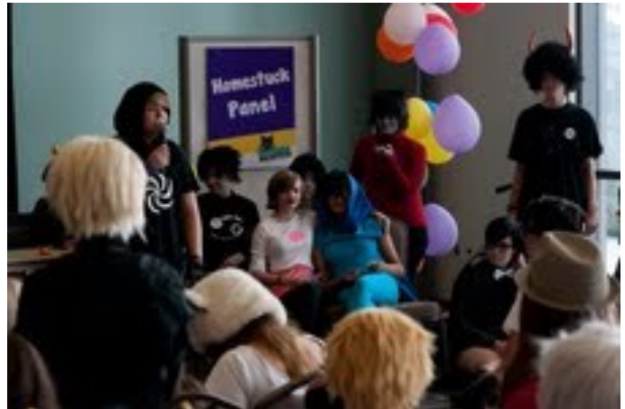
Teens at ToshoCON

Teens participated in panels, card gaming, crafts, a manga swap, cosplay (costume play) contest, viewing room, and a dance to end the night. In addition, teens could buy all sorts of anime-related