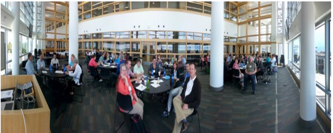
UALC Professional Development Retreat attendees, August 9, 2013