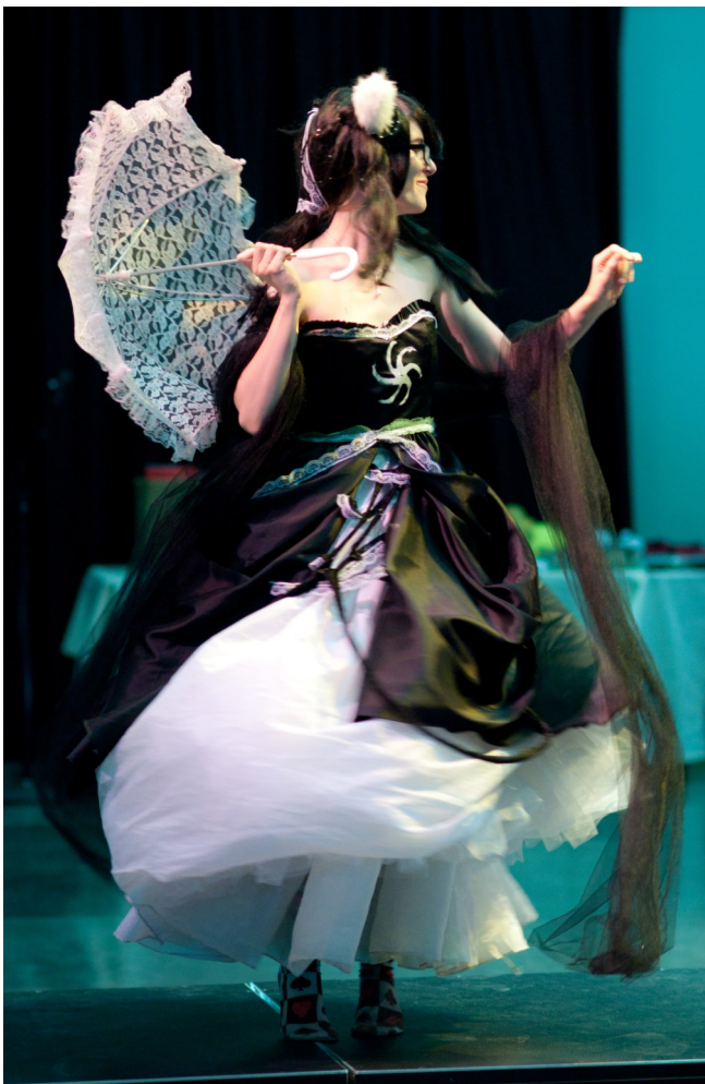
Cosplayer at ToshoCON

goodies and games from the vendor marketplace or food trucks at the event.