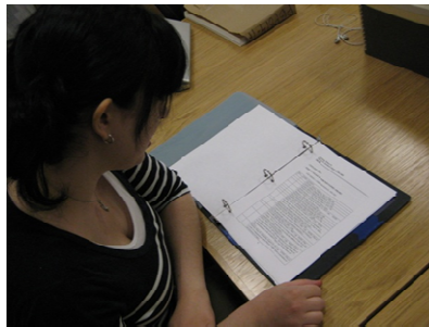
Traditional Print Finding Aid

Many libraries have "special" collections that often aren't part of the main collection. Well-designed finding aids, especially when searchable and offered online, will help patrons to discover your library's treasures. Finding aids can be as basic as printed descriptive lists, or more in-depth, as are the encoded electronic files created by several Utah libraries and archives.