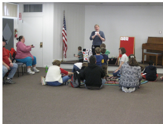
Storytime at the Kearns Library

This has been a very rewarding experience for me and I plan to continue each month on a Saturday morning. However, it would not have come to pass without the support of the Salt Lake County Library system, special education teachers, and other specialists who have provided their expertise.