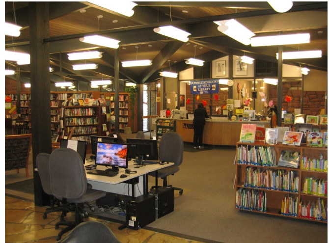
Inside the new Monticello Library.

Everyone at the San Juan County Library is excited and feels we can now better serve our patrons. We express gratitude to the San Juan County Commissioners, San Juan County Library Board, Chamberlain Architects of Grand Junction, Colorado, and Tri