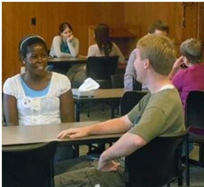
USU's “Human Library”