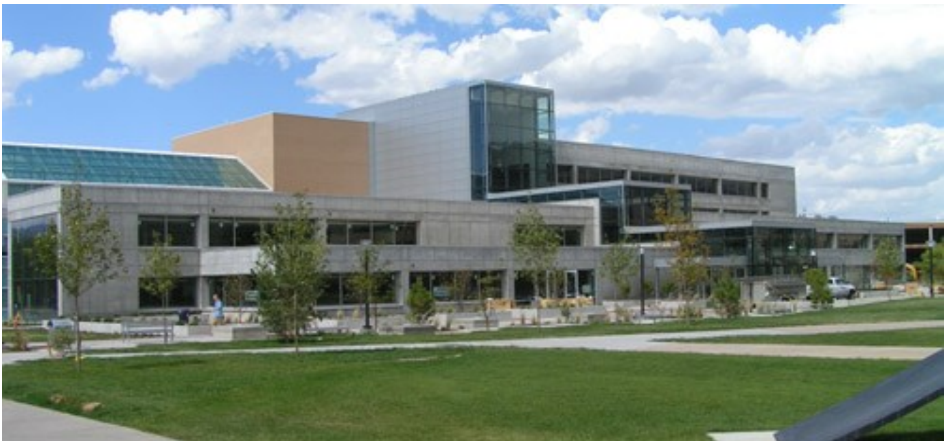
USU's Merrill-Cazier Library.