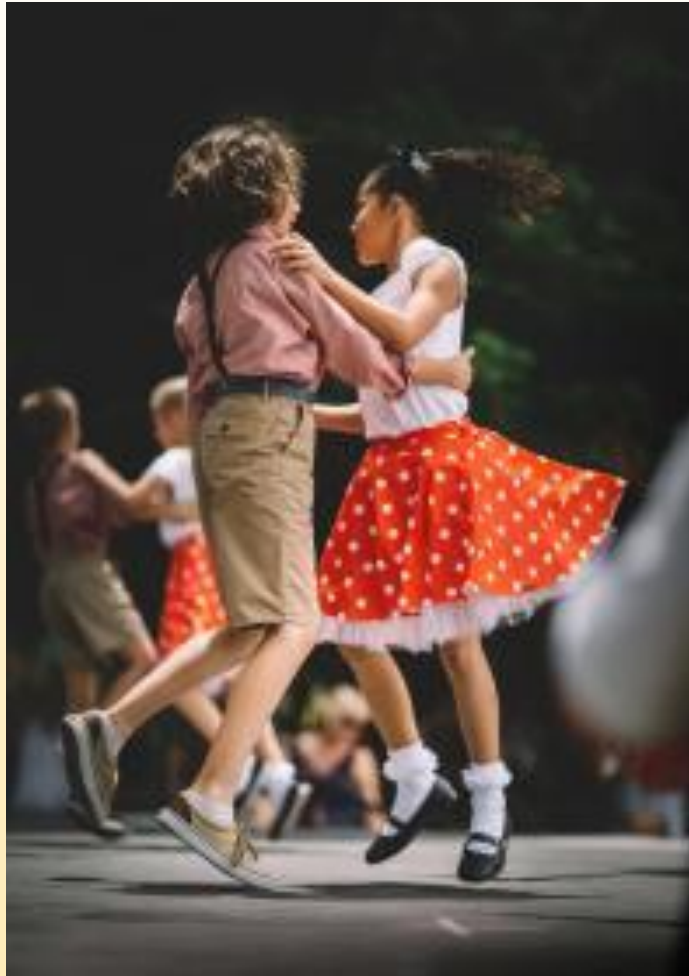
ULA 2017 Sandy, Utah