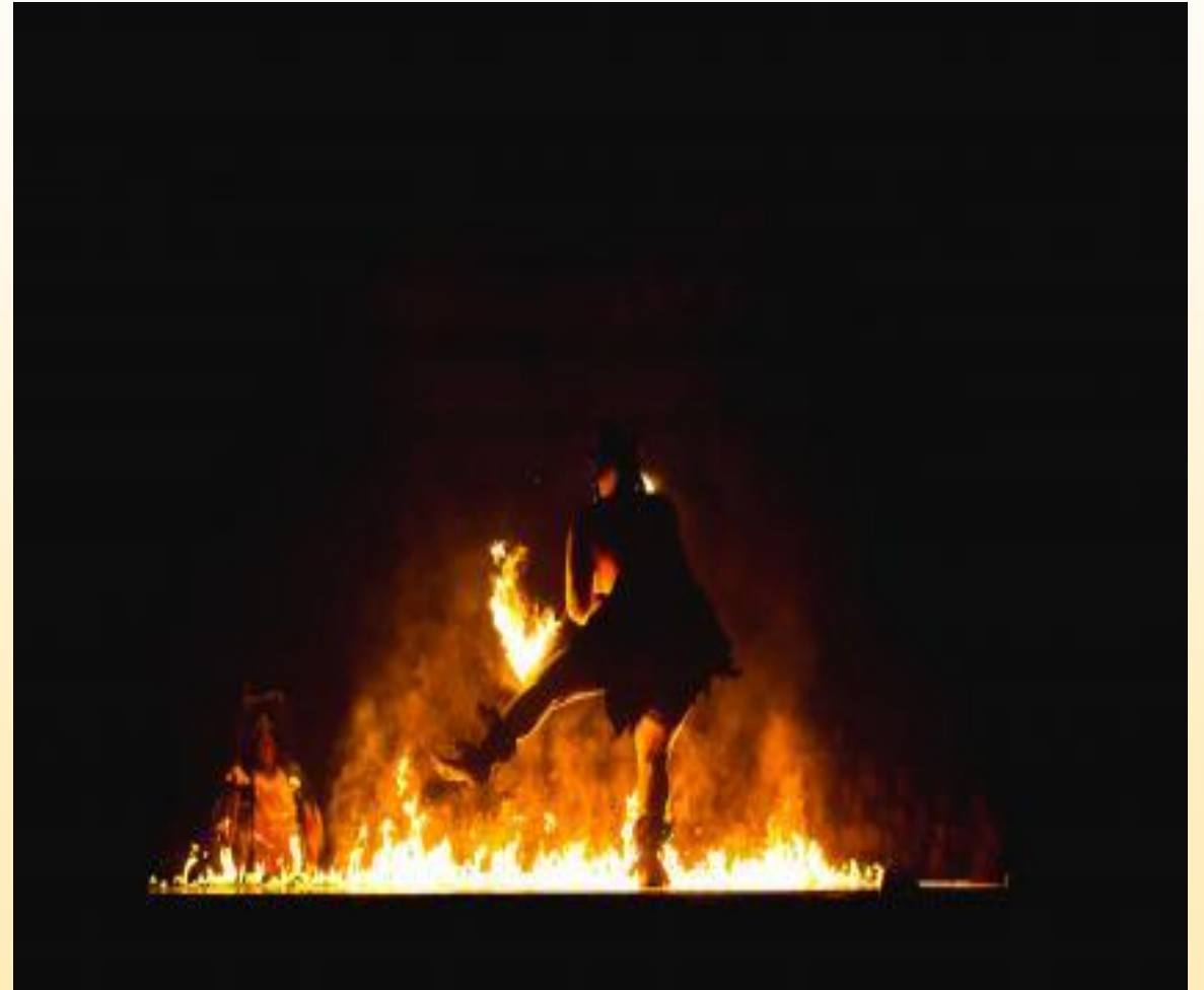
Grants, Partners and Outreach - Oh My!