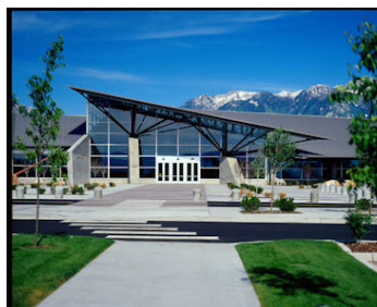
South Towne Exposition Center